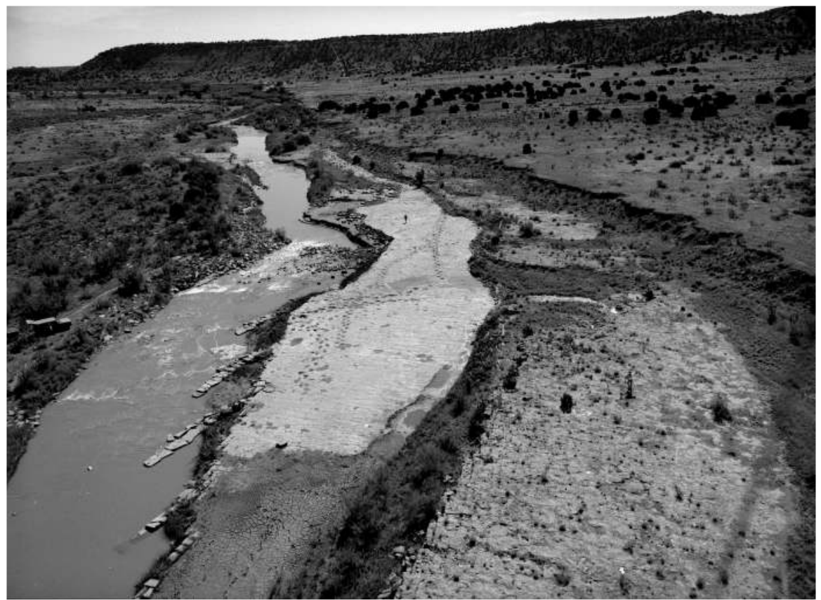
Picketwire Canyonlands, SE Colorado - Rock vanes used to protect dinosaur trackway. These structures were installed in 1998, and survived a 100 year event the following spring. Note the deposition and new willow vegetation taking hold in between the structures. The photo below shows the Project nine years later.