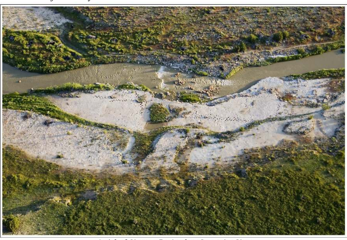
Aerial of Dinosaur Tracks along Purgatoire River Picket Wire Canyonlands, Comanche National Grassland, southeastern Colorado Copyright 2007 Wendy Shattil/Bob Rozinski www.dancingpelican.com Permission of USDA Forest Service