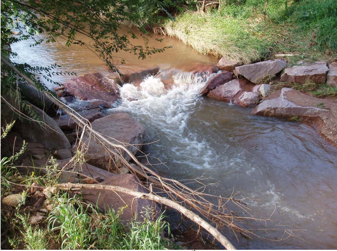
Cross Vane Structure on Fountain Creek below 21st Street Bridge, El Paso County, CO.