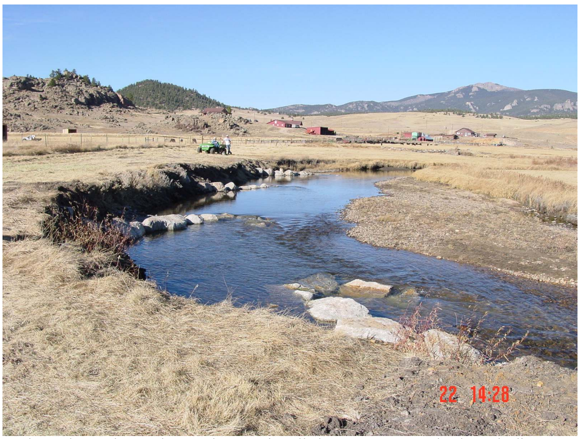
Eagle Rock Ranch - Rock J-Hook Vanes installed to protect stream banks and adjacent road,, 2003.