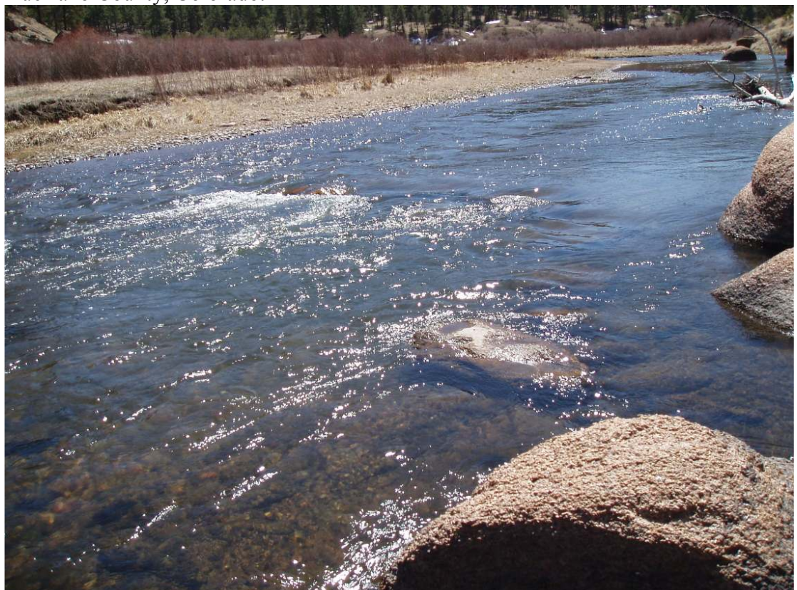
Boulders placed in clusters to create pocket water micro vortex habitats. South Platte River, Park County, CO.

Cottonwood trees used as toe-slope stabilization with riparian benches. Cucharas Creek, Huerfano County, Colorado.